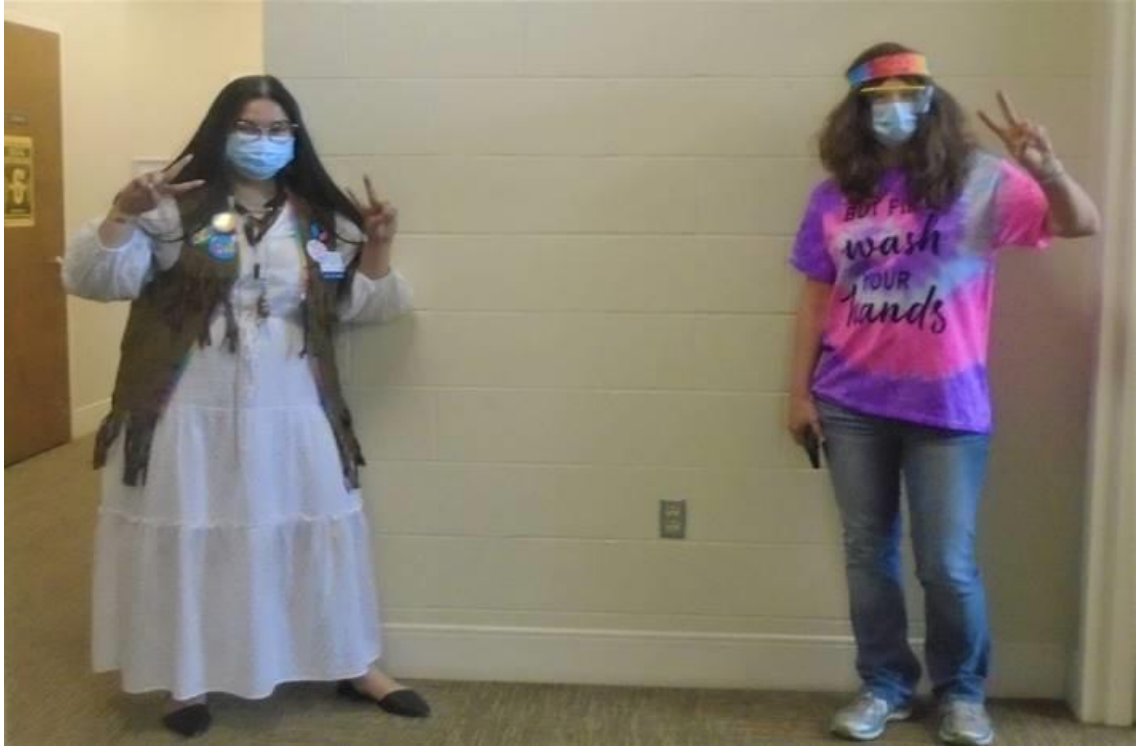
Staff from the past