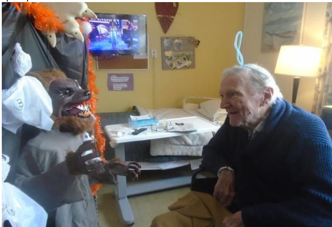
Spooky Cart -crazy hair