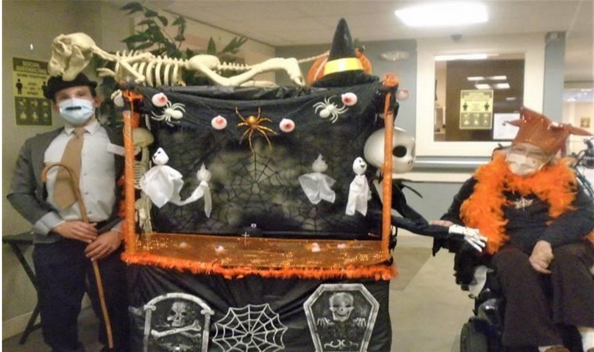
Spooky Cart – Staff and resident