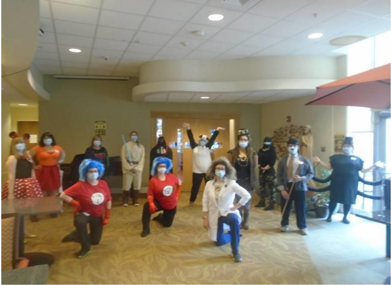
Some staff before the Halloween parade